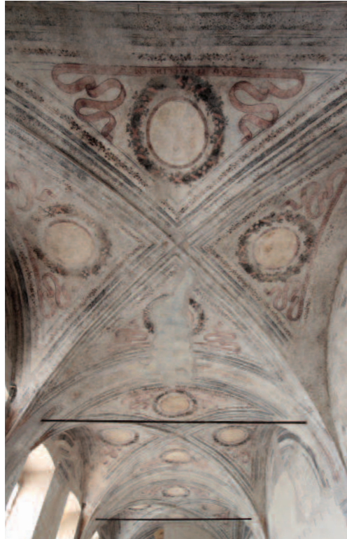
Decoration on the ceiling of the old Spanish Hospital room where Michelangelo's Pietà Rondanini is displayed

The story of the Milanese Pietà is still shrouded in mystery to a large extent: the sculpture was found in Michelangelo's Rome studio upon his death on 18th February 1564. It then vanished and only reappeared definitively in 1807 in the mansion of the Marchesi Rondinini (or, using its incorrect form, Rondanini) on Via del Corso. The work thus became known as: Pietà Rondanini . After several transfers of ownership following its departure from the Roman mansion, the sculpture was acquired with public funding by the City of Milan in 1952. In the meantime, the style of the piece, which had long been overlooked and considered unimportant to Michelangelo's body of work, became the subject of discussion among critics and contemporary artists and the Pietà Rondanini , unique in the context of sixteenth century sculpture, acquired a privileged position in the history of art.